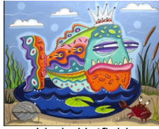
Linda Hatfield "Big Fish in a Small Pond" Pyrography