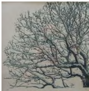
Untitled Mark Humsieker Linoleum Black Relief Print