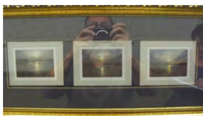
Honorable Mention "Platte River Sunset"