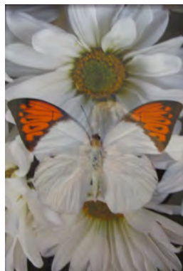
Honorable Mention "Japanese Orange Tip"